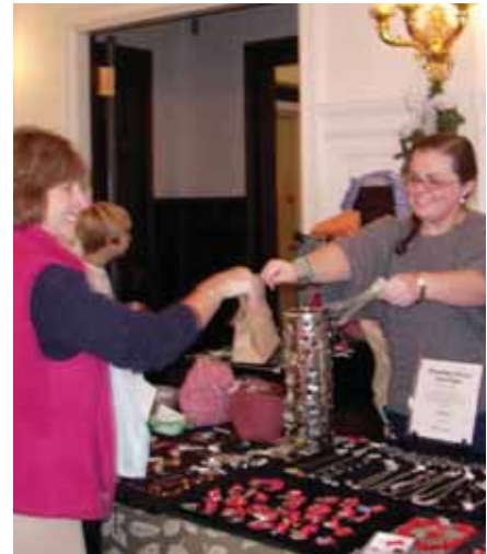
Our Lady's Haven holiday craft fair