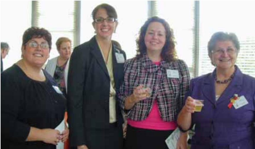
Mission Mass at Catholic Memorial Home