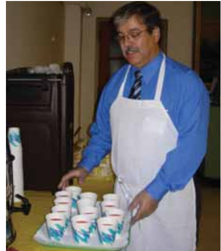
Sacred Heart Home spaghetti dinner