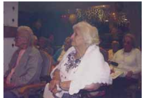
Pastoral Care Week at Marian Manor