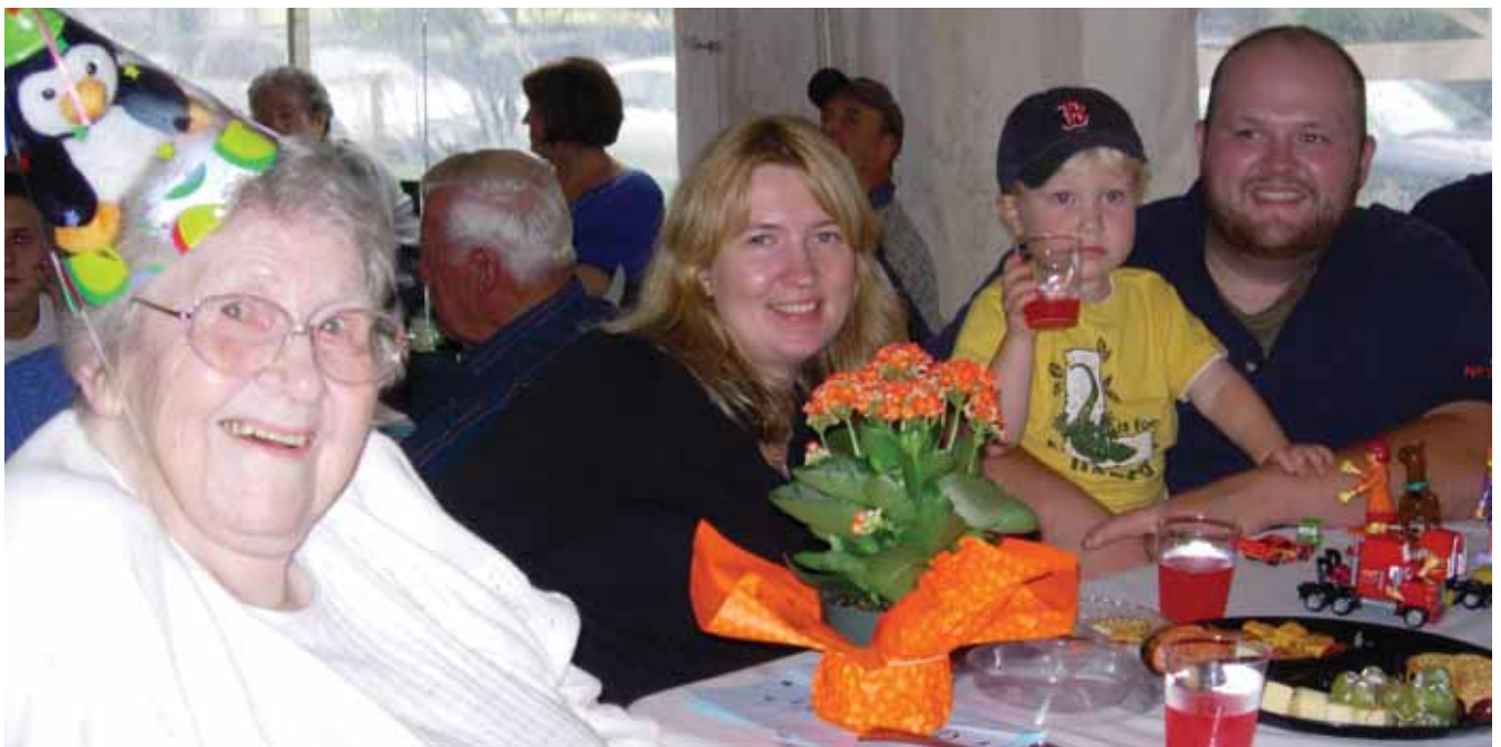
Celebrating a birthday with family and friends at Grandparent's Day