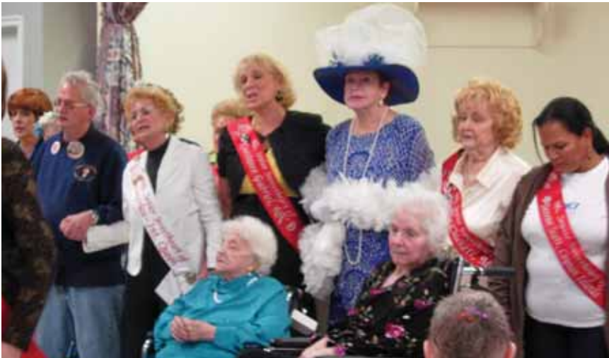
Senior Sweethearts perform at Catholic Memorial Home