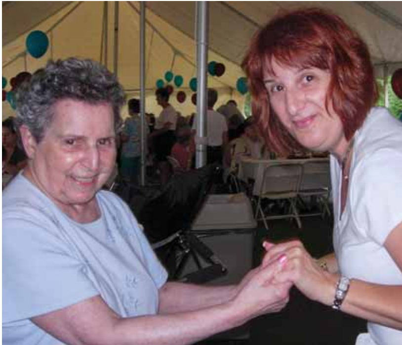
Celebrating Grandparent's Day at Our Lady's Haven

Autumn is a special time of the year when the Diocesan Health Facilities homes celebrate life with their residents. Here are some scenes from activities that brought smiles to the faces of our residents, friends, volunteers and staff.