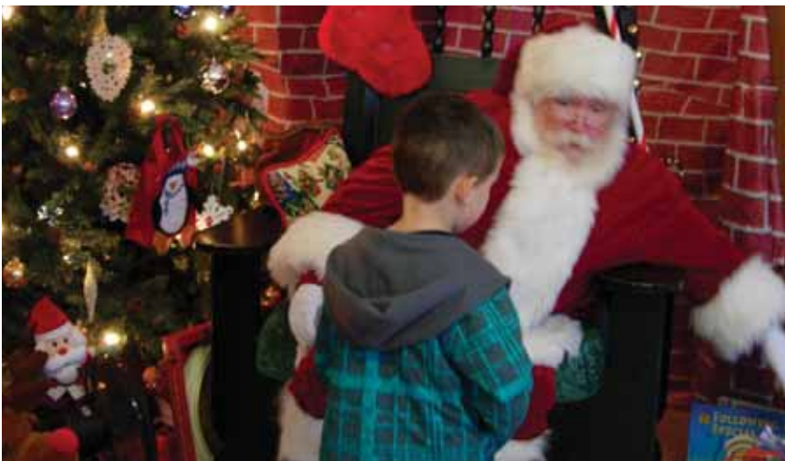
Santa was a busy man at Madonna Manor's Christmas Bazaar in November